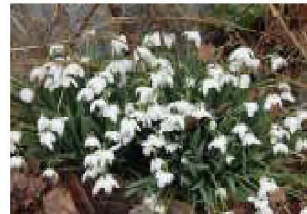
A healthy clump of Galanthus nivalis (Snowdrops) blooming in early spring.