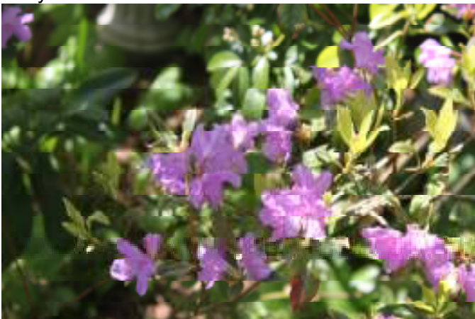
Rhododendron dauricum var. sempervirens blooming in early May.