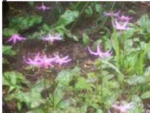
Erythronium revolutum , a native plant used by our First Nations, still grows in special areas of the island. It is thriving here in Milner Gardens, Qualicum Beach.

Agnes will take us on a tour of the areas on Vancouver Island that she loves to visit. She'll show you the diversity of native plants that we can enjoy just a short distance from our homes. We will also hear a few hints on how we can simplify our home gardens so we can have more time to enjoy the great outdoors. Husband Dave is the photographer and helps in the garden as well..