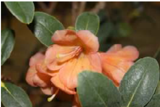
Rhododendron 'Alison Johnstone'